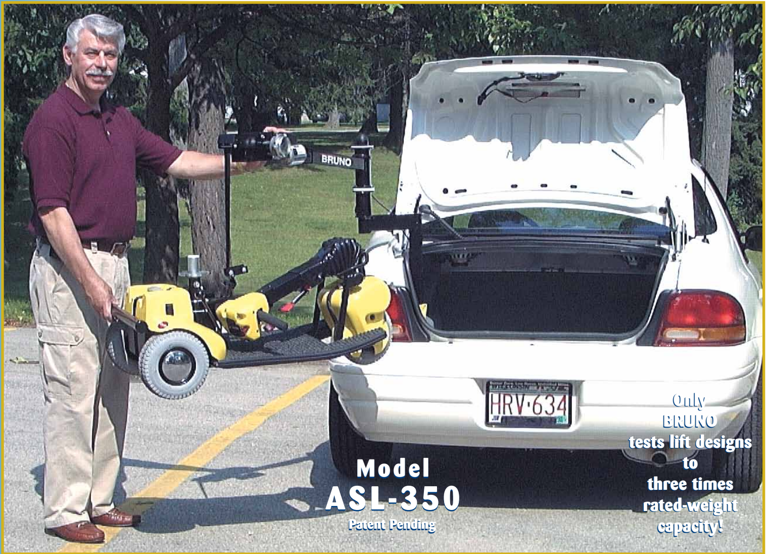
Model ASL-350 Patent Pending

Only BRUNO tests lift designs to three times rated-weight capacity!